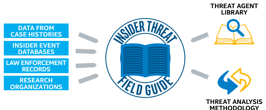
Figure 1. The Insider Threat Field Guide is a unique security asset that can help identify the most common insider threat agents along with their primary means of attack. We based the information in the field guide on information from many internal and external sources.